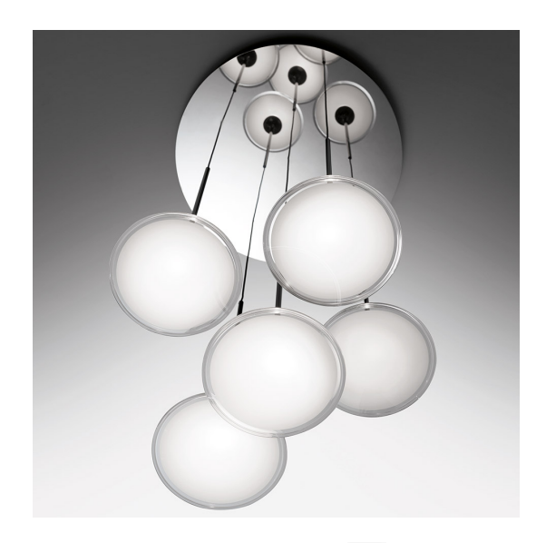
IP 20 (€ Dimmerable: +① -